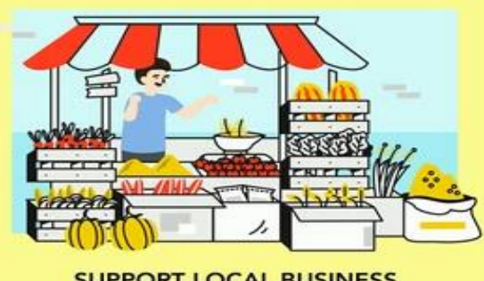
SUPPORT LOCAL BUSINESS VOCAL FOR LOCAL

For inquiries and registration, please contact: